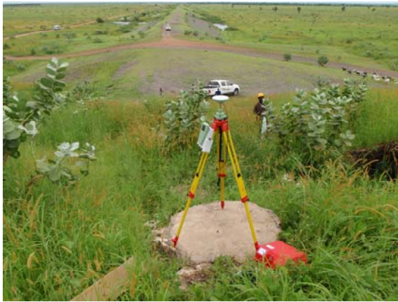
Figure 2 – Station A0 Left abutment

Results from the primary network observations were produced using the AUSPOS internet service provided by the geodesy department of Geoscience Australia, an Australian Government organisation. AUSPOS produces solutions which are in the WGS84 system at the epoch of observation.