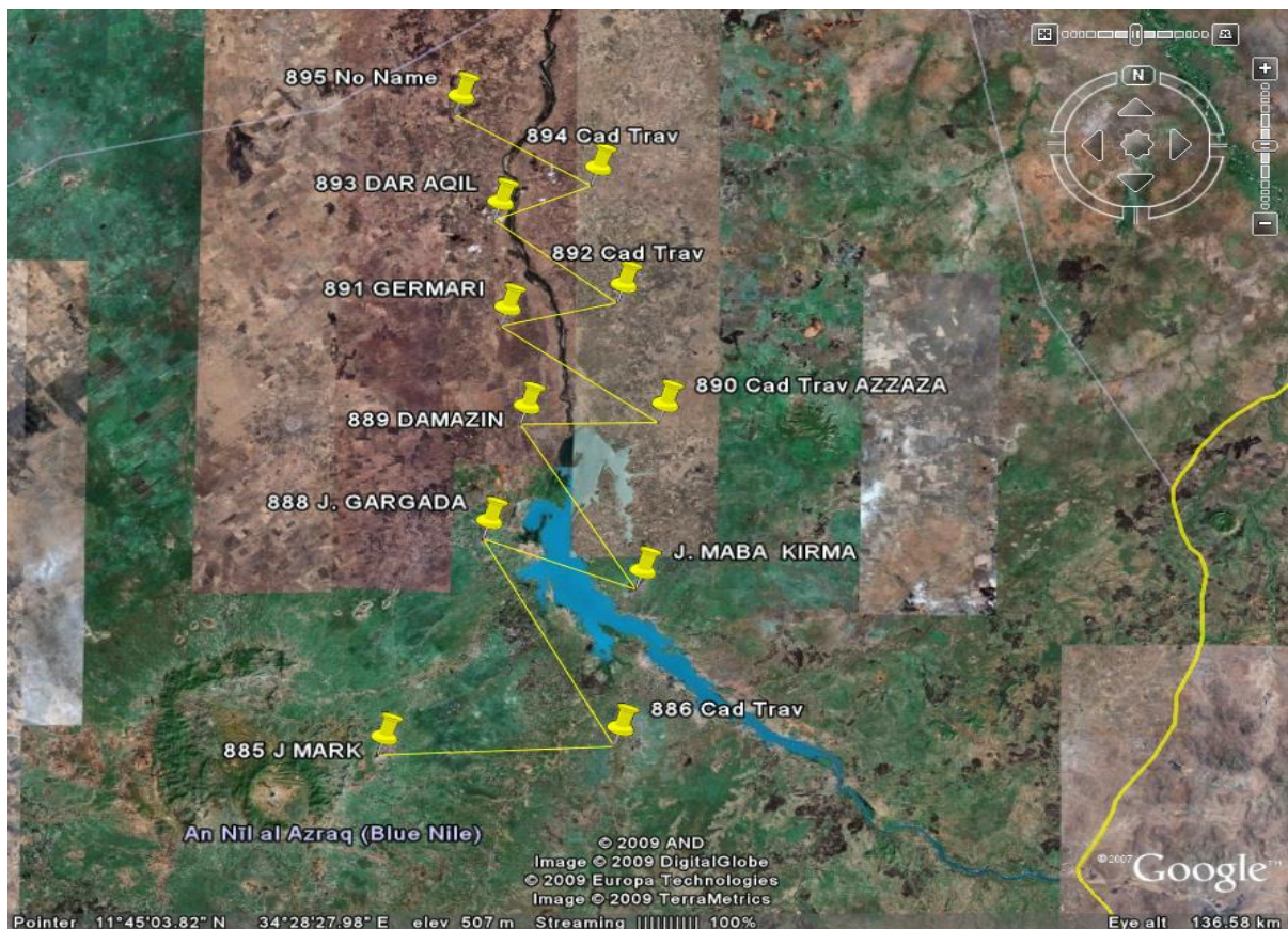
Figure 1 – National Trigonometrical Stations in the Damazin region

This connection was necessary because the irrigation projects being conducted by Lahmeyer International are all in the ADINDAN system and a precise connection to RDHP relevant features (canal headworks, hydrostatic modelling and storage data) was required.