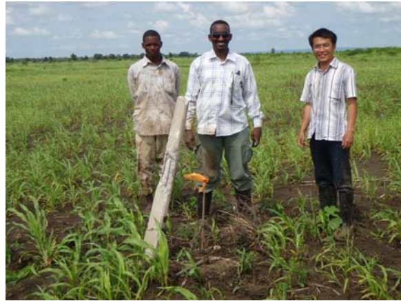
Figure 3 – Station B0 Right abutment

As the RDHP observations were at the epoch of August 2008, in order to check the IGN values, it was necessary to rotate the results back to the epoch of the DIUREF2007 system, which was given as 2005.0. This was done using the NNR-NUVEL-1A tectonic plate velocity model and compared with the IGN values. Results indicated no significant discrepancies in the IGN reported values for the East and North coordinates. The GPS results also confirmed no gross errors in the elevations for the three provided stations (C1, C2 and C4).