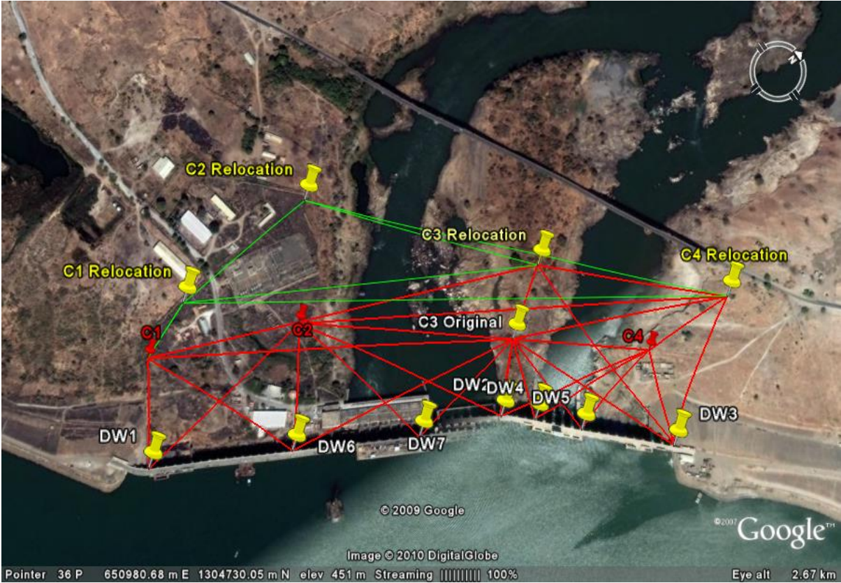
Figure 5 – Concrete Dam Control Stations

The stations C1 and C4 are currently in the proposed canal alignment corridors. The stations C3 and C2, being low and close to the wall, and with the 10 metre increase in the crest level, will produce very steep sightings to the crest works. Therefore all stations are to be relocated as per Figure 5. In March 2009 only the station C4 Relocation had been constructed.